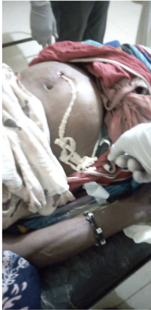
Figure 1. Tape-worm emerging from the site of penetrating abdominal wound in a case presented with penetrating abdominal trauma at the Outpatient Clinic, Elhassaheisa Teaching Hospital, Gezira State, Sudan; December 2019.

long (Figure 1). Two large intravenous canulae was inserted and patient received 1 liter of Normal Saline, anti tetanus shot as well as I. V. antibiotics.